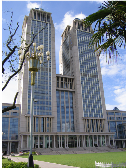
Figure 1: Guanghua Twin Towers

tend to uniform distribution in the high energy limit. Such results were first stated by Shnirelman, and proved by Colin de Verdière and Zelditch. We will present a version for semiclassical Schrödinger operators on a compact manifold.