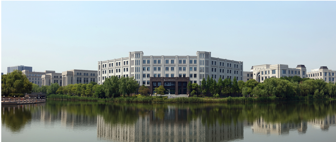
Figure 2: The SCMS Building